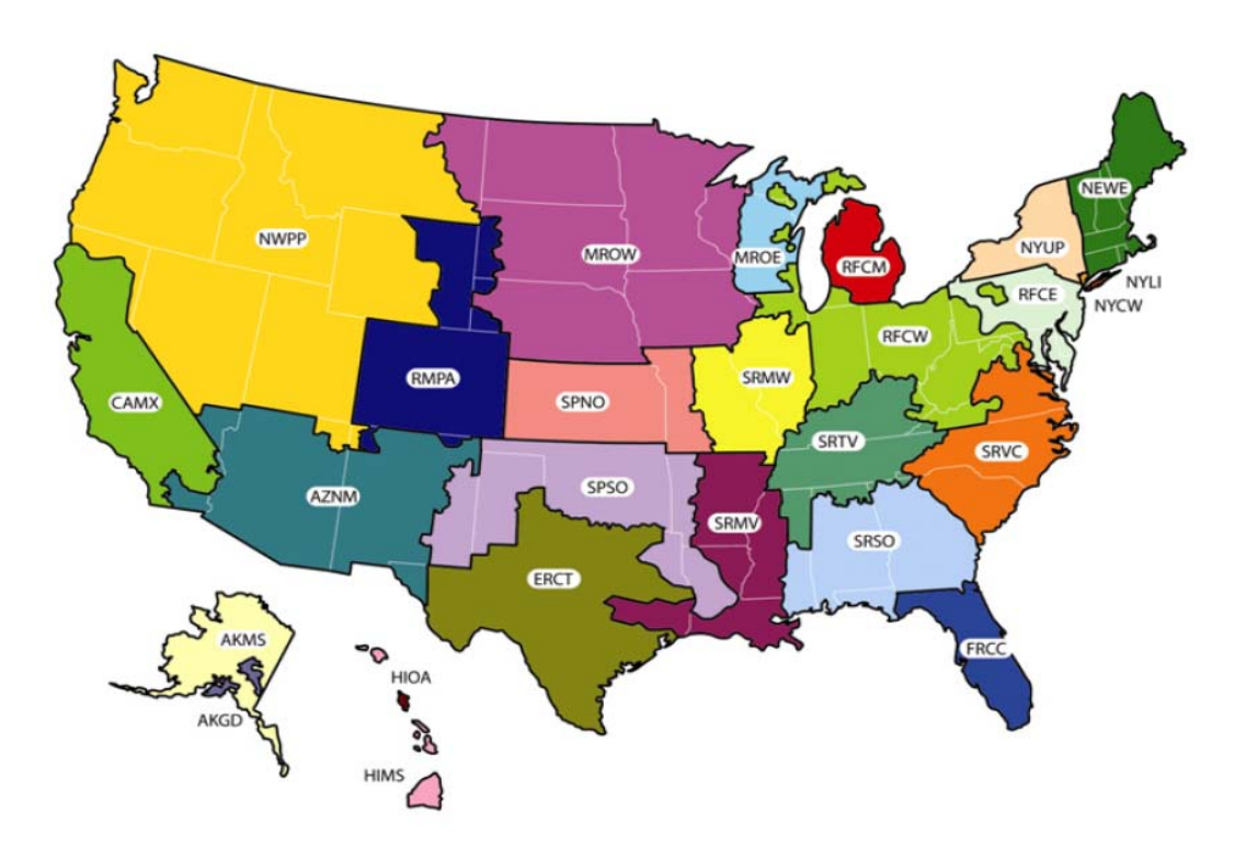
Figure C.1. Map of eGRID2007 Subregions